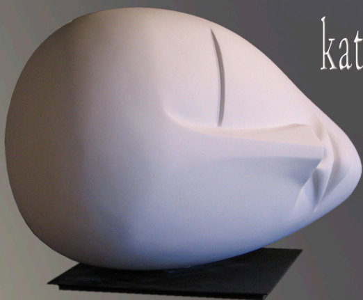
Tomorrow's Dreams 20h 33w 18d unique aerblock best in show & purchase award - sculpture at the river market, little rock, ar oct2007