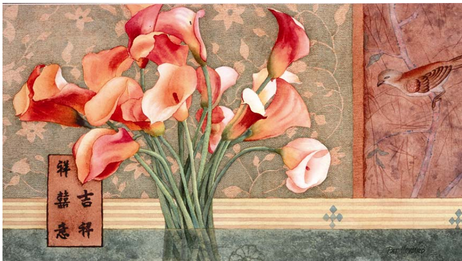
" P R O M I S E S O F S P R I N G "

Pat's newest work is pushing the boundaries of genre painting and the medium of watercolor as she integrates art historical influences with contemporary design in alluring spatial plays of juxtaposed objects which challenge the 2-dimensional picture plane. This creative process is producing strikingly bold and thought-provoking statements.